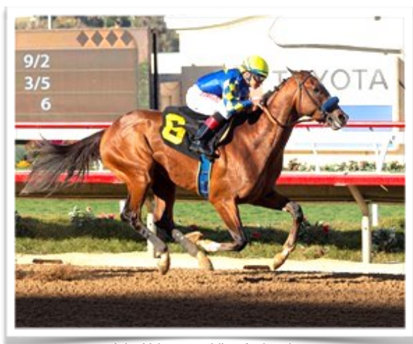
John Velazquez riding Authentic

On September 3, 2020 aside from owners and a select few guests, the stands were almost empty for the annual 146th Kentucky Derby which ran at historic Churchill Downs. Authentic and his jockey John Velazquez ultimately found their way to finish first on the soft, turf track. The favorite to win, Tiz The Law, ran a close second and Mr. Big News finished third. Authentic donned the iconic derby garland in the winners circle, which is composed of 465 roses and weighs 40 pounds. In the circle however, the winning horse had a bit of a spook and actually knocked over his trainer, Bob Baffert. Interestingly enough Baffert had another horse who was supposed to run in the race, Thousand Words, but earlier in the day that horse flipped over in the paddock and had to scratch from the race. The run for the roses was nothing short of an upset. A huge congratulations to Authentic on his win in top form!